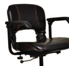
Swivel Comfort Seat