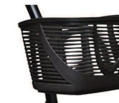
Front Storage Basket