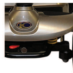
Safety Tiller Lock