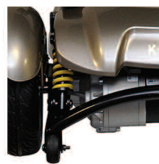
Front & Rear Suspension