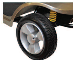
Puncture Proof Wheels