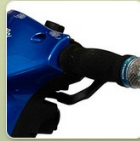
Road crossing safety handle bar LED lights