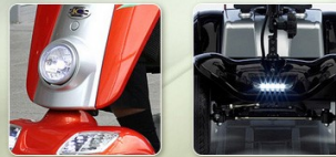
New low consumption LED lighting