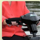
Delta Type handle bars