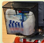
Lockable rear basket