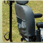
Rear Walking frame holder