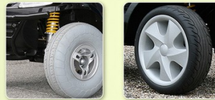
Comfortable suspension & puncture-free soft roll tyres