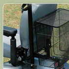
Walking Stick Holder (Can be Mounted with Rear Basket)