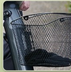
Front Basket kit