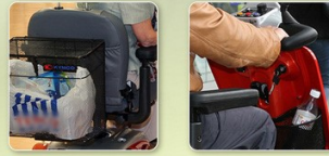
Excellent on-board storage facilities