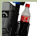
Drink Storage Holder