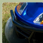
Steel Front Bumper