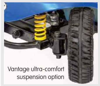
Vantage ultra-comfort suspension option