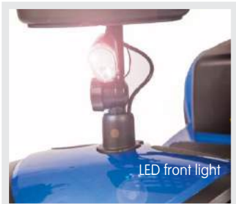
LED front light