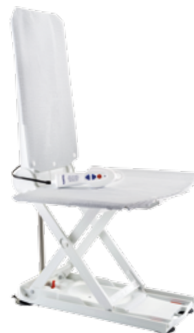
Aquatec Orca NG F

An upright bath lift with a fixed backrest, that offers support for those who prefer to bathe upright. The integrated head support of the high backrest ensures a safe and comfortable bath.