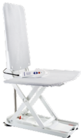
Aquatec Orca NG